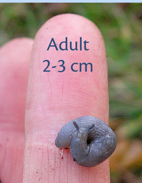
Adult 2-3 cm