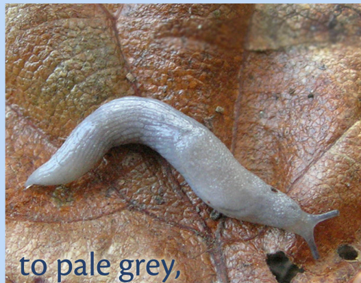
to pale grey,