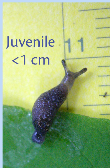
Juvenile <1 cm