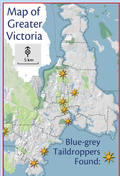
Map of Greater Victoria