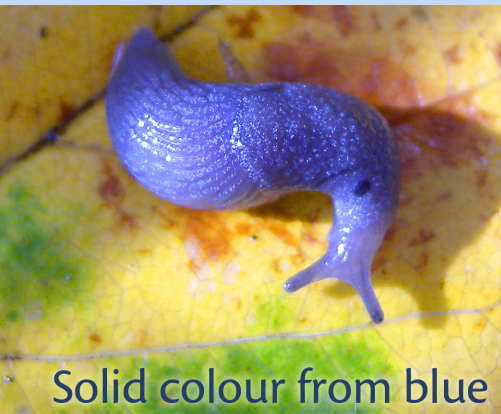
Solid colour from blue

Please send slug photos for ID to hatmail@hat.bc.ca or call 250.995.2428 HAT acknowledges funding from the Government of Canada's Habitat Stewardship Program