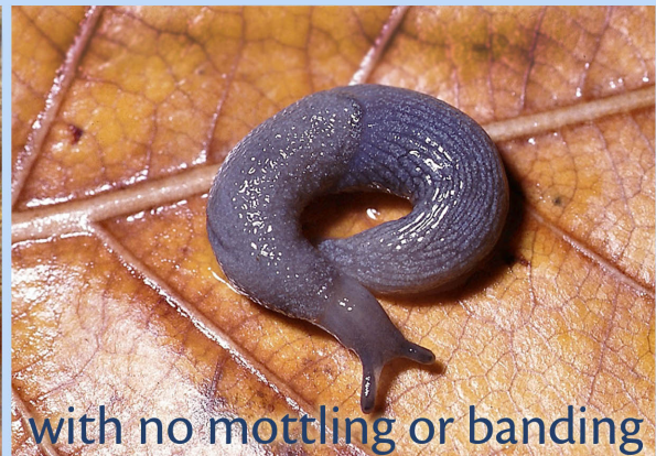
with no mottling or banding