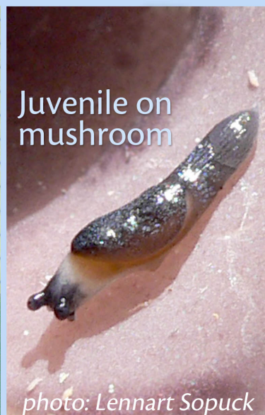
Juvenile on mushroom